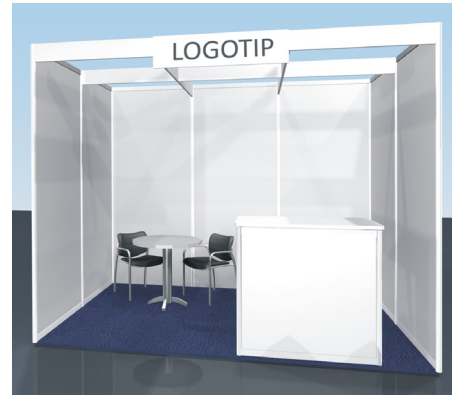
standard exhibition booth